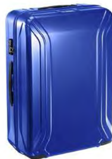
NO HARD BODY CASES