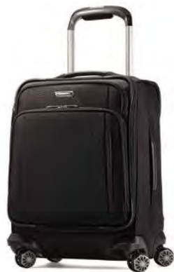
NO WHEELED OR PULL HANDCASES