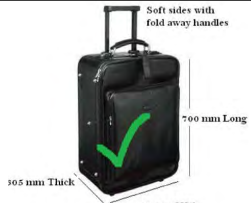
SOFT SIDED BAGS WITH WHEELS THAT ARE NOT IN HARD FRAME