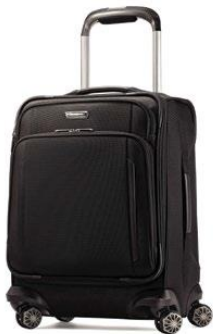
NO WHEELED OR PULL HANDCASES