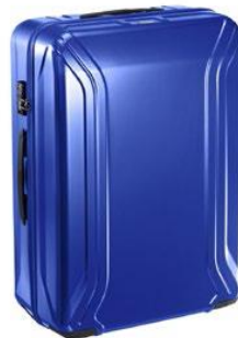
NO HARD BODY CASES