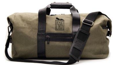
SOFT SIDED BAGS ONLY